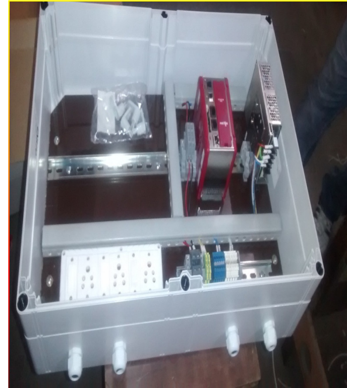
IP 67 Roof Top