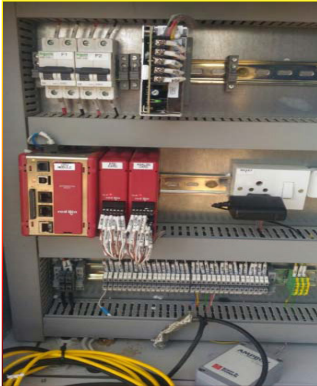
IP 65 Ground Mounting